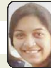
Salvia Koli Pune

For previous results visit website www.fulor.org